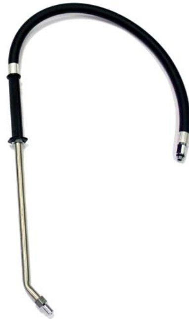
Wet Chemical Lance